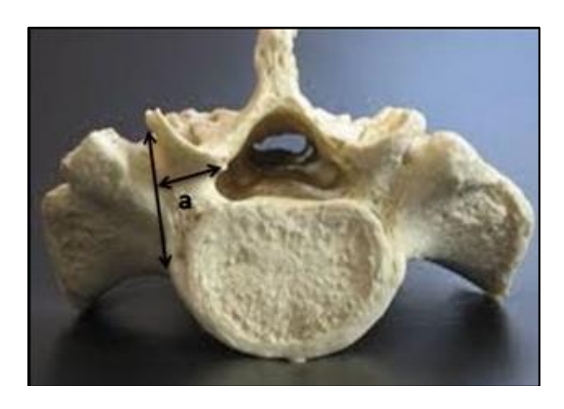
Fig. 4: (a) Width of pedicle

4. The Width of Pedicle (Fig. 4): It is perpendicular distance from anteroposterior length of pedicle length to the outer margin of the sacral canal.