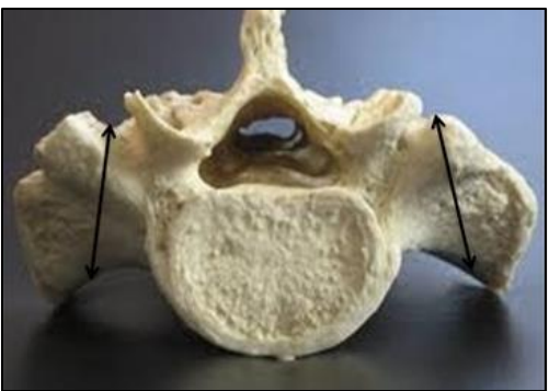
Fig. 5: Antero posterior length of ala