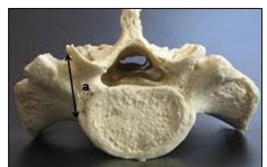
Fig. 3: (a) Antero posterior length of pedicle