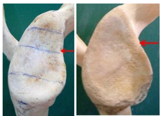
Fig. 3 & 4: Pear shaped glenoid fossa of Right scapula with Red arrow pointing towards the shallow notch on the anterior margin of the glenoid fossa