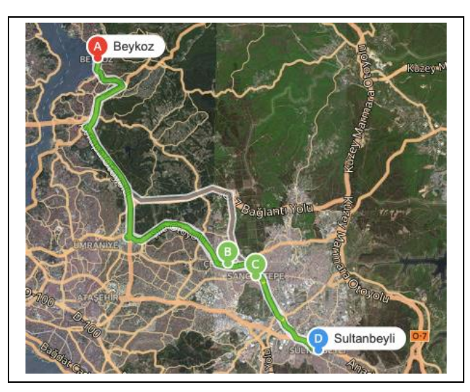
Figure 2: A sample path between Beykoz-Sultanbeyli.