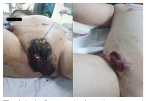
Fig. 1. In the first examination, all scrotum and perineum was involved and there was spontaneous opening in the lower abdomen.

admitted to the emergency department with complaints of fever, vomiting, diarrhea, necrosis in the scrotum and lower abdomen. The patient's blood pressure was very low, circulation was distorted and superficial spontaneous breathing was observed. He was intubated and admitted to the intensive care unit upon deterioration of his general status. The patient whose blood pressure could not be measured was loaded 1 time with saline from 20 cc / kg. Dopamine and Adrenaline infusion was started in the patient with low blood pressure. Laboratory tests showed a white blood cell count of 26.800/mm<sup>3</sup> (normal, 6000–12,500/mm<sup>3</sup>) and a C-reactive protein of 113 mg/l (normal, < 6 mg/l). Combination of vancomycin, meropenem, amikacin, ambisome, clindamycin, and metronidazole was given in antibiotherapy. Patient underwent surgery after supportive treatment. Lower abdomen, genital area and perineum were completely involved (Fig. 1).