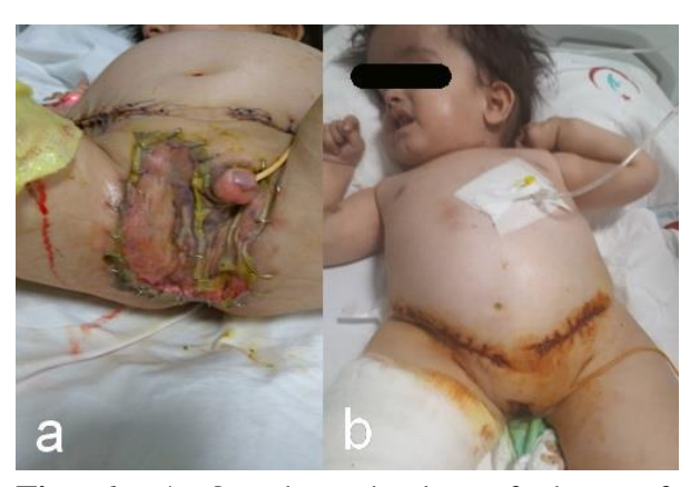
Fig. 6. a) On the 6th day of the graft application, the graft was alive. b) Abdominal wounds were healed and the child was extubated.

abdominal wounds were also healed (Fig. 6 a, b).