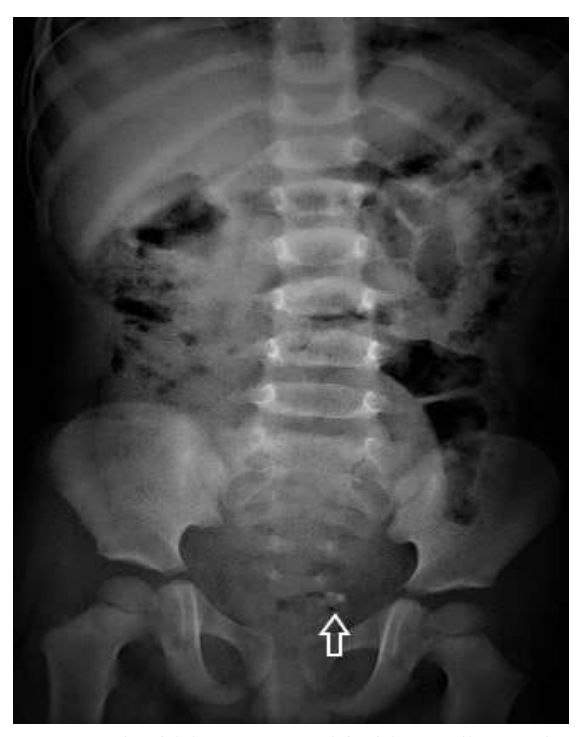
Fig. 3. The kidney-ureter-bladder radiography showed several clustered opacities.

(Sol: 49.8 Right: 50.2). We decided to perform open surgery and when bladder was opened, an edematous ureterocele was seen on the left and a single orifice on the same side (Fig. 4). A small incision was made to the ureterocele and seven pieces of stones of which the largest one was approximately seven millimeters in size, were extracted (Fig. 5, 6).