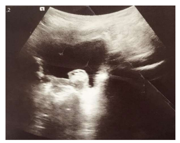
Fig. 1. Ultrasonography image of the stone in the ureterocele.

to recurrent UTI. Left Grade 1 vesicoureteral reflux (VUR) was detected (Fig. 2). The kidney-ureter-bladder radiography showed several clustered opacities of approximately 4-5 mm in the bone pelvis on the left side (Fig. 3).