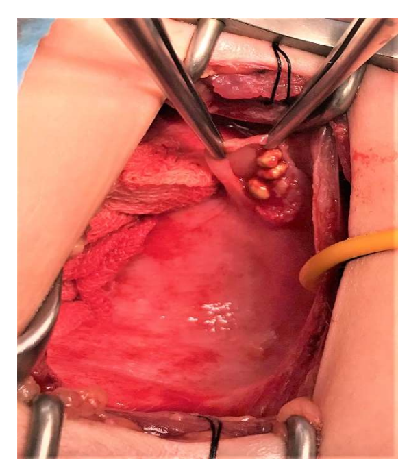
Fig. 5. Multiple stones inside ureterocele.