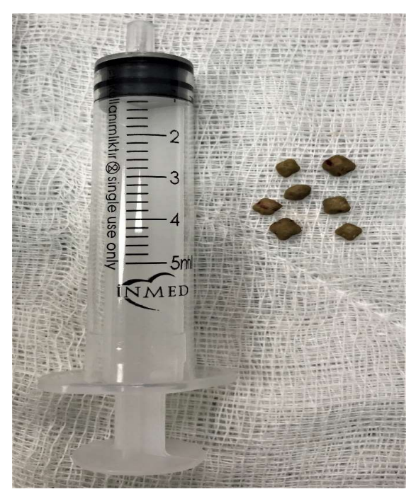
Fig. 6. View of the seven stones extracted from the ureterocele.

Retrograde pyelography (RGP) was performed by administering opaque material through the ureteral catheter which was placed in the left ureter. There was no evidence of dilatation or obstruction in the ureter. It was dissected and