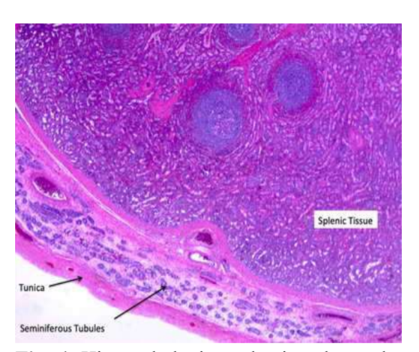
Fig. 4. Histopathologic evaluation shows the immature testicular tissue and large amount of splenic tissue separated by a thin fibrous capsule.

Histopathologic exam of the specimen revealed immature testicular tissue and large amount of splenic tissue, separated by a thin fibrous capsule, consistent with the diagnosis of SGF (Fig. 4).