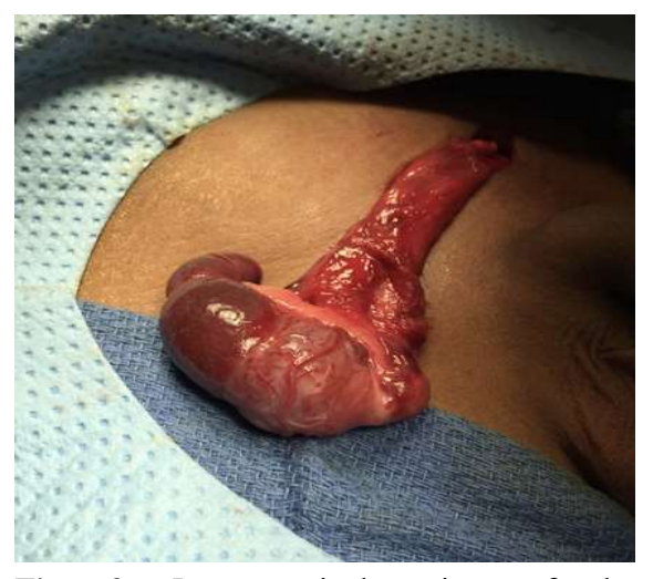
Fig. 3. Intraoperatively view of the splenogonadal fusion.

note, the patient had a previous abdominal US revealing a normal spleen. The patient tolerated the procedure well and was discharged home on the same day.