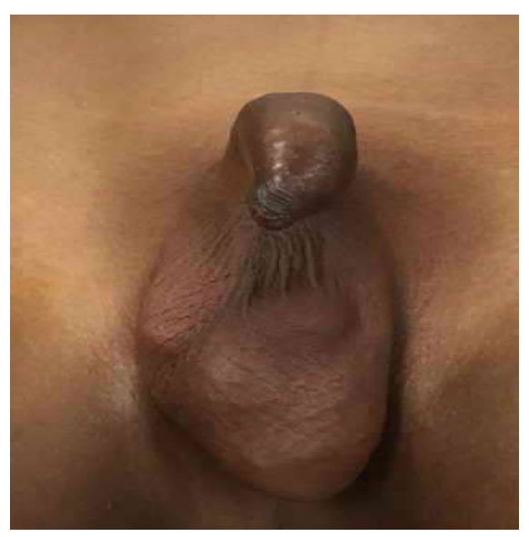
Fig. 1. A firm and nodular appearance of the left testis on physical examination.