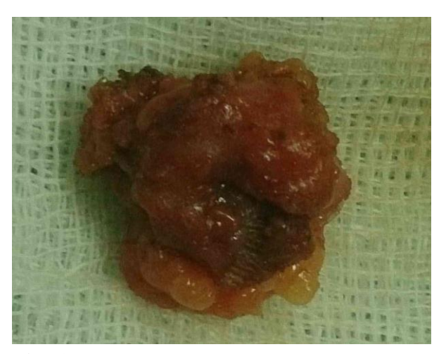
Fig. 3. The appearance of the excised cystic masses.

with the overlying skin, was completely excised, and the wound was closed in layers over a negative suction drain, which was removed on the 2nd postoperative day. The postoperative period was uneventful, and the child was discharged in fair health on the 3rd postoperative day.