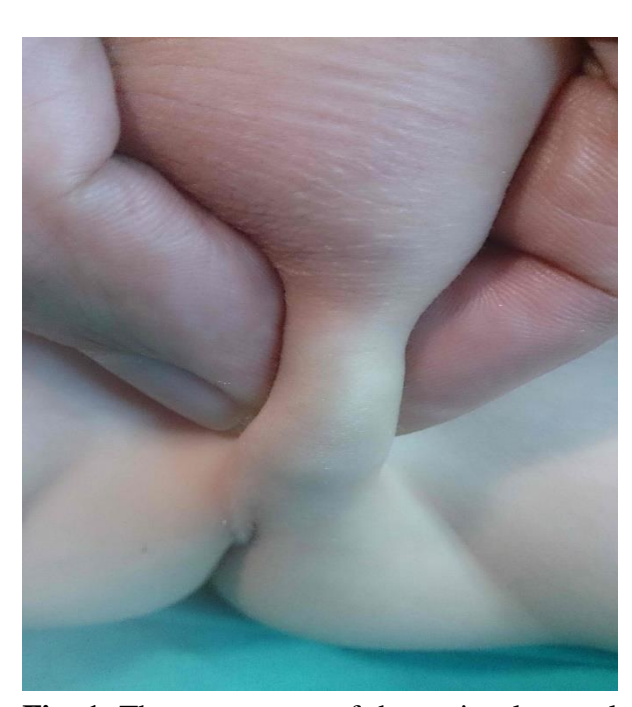
Fig. 1. The appearance of the perineal-scrotal mass in the examination.

A 3-year-old male patient was brought to the clinic by his parents, who had noticed a swelling in his perineal region that was present at birth and had gradually increased in size.