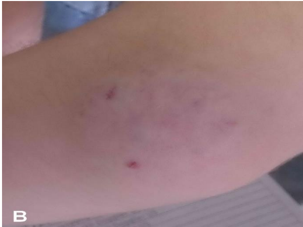
Fig. 2. A, B. The hemangioma on the right eyelid and left elbow.

The patient underwent exploratory surgery after routine examinations. A perineal and scrotal incision revealed a 3 \times 3 cm multilocular cystic mass that was adherent to the scrotal wall (Fig. 3). The left testis and the spermatic cord were healthy. The mass, along