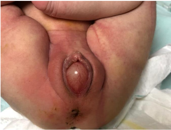
Fig. 1. Imperforate hymen as bulging mass filling the vaginal introitus.

anesthesia, and approximately 100 mL of serous fluid was drained.