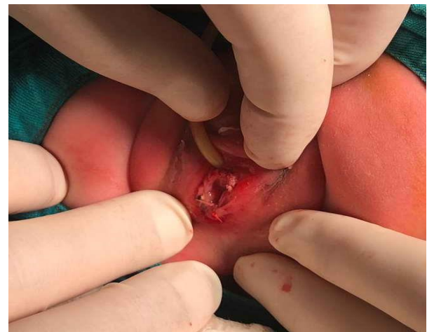
Fig. 4. After operation view of the vagina.