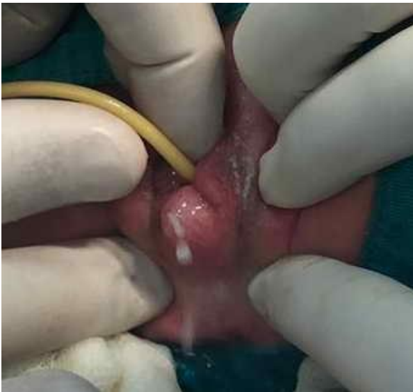
Fig. 2. Appearance of imperforate hymen and urethral foley catheter.

The hymenal orifice was then extended by excising some hymenal tissue (Fig. 4). A 10 French Foley catheter was placed in the vagina, and the balloon was inflated with 1 mL of sterile water to promote patency of the hymen. The balloon remained there for one week. The symptoms resolved, and the child was discharged. Subsequent control US imaging showed normal appearance of the uterus, vagina, and urinary tract.