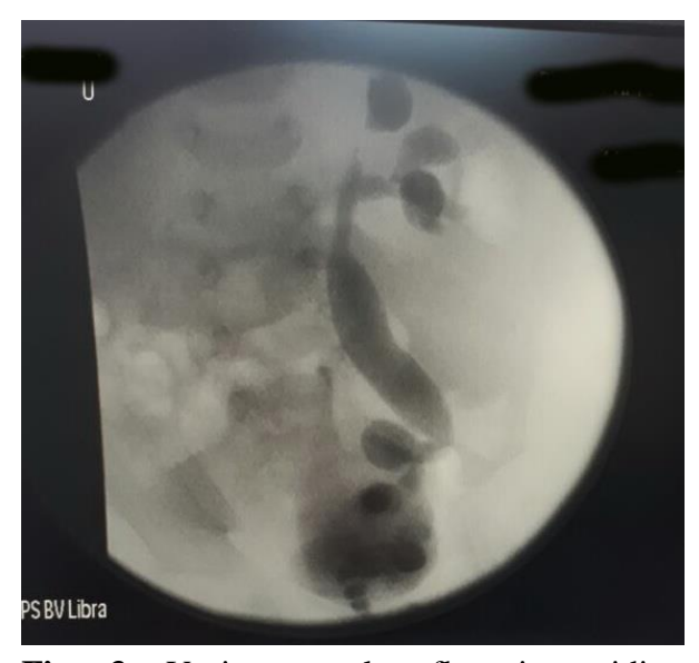
Fig. 3. Vesicoureteral reflux in voiding cystourethrography.

Examination of the urinary tract by ultrasonography revealed right renal agenesis and left Grade 2 hydronephrosis. The patient was then investigated by voiding cystourethrography and Grade 2 vesicoureteral reflux was determined (Fig. 3).