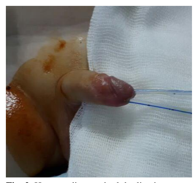
Fig. 2. Hypospadiac urethral duplication.

abnormalities and testes were bilaterally present in the scrotum. The patient's blood counts, blood chemistry, urine analysis, and urine culture were normal.