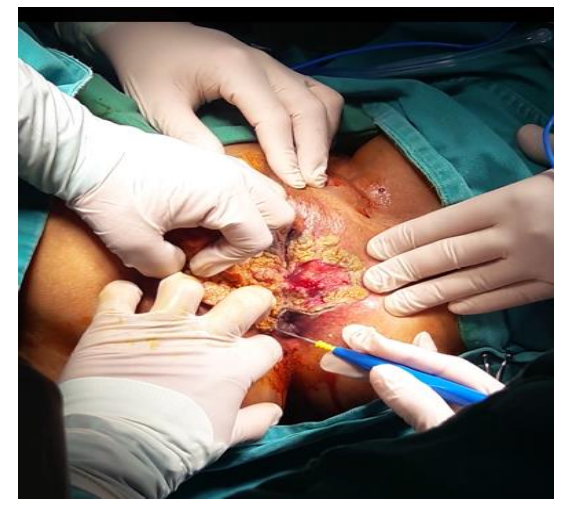
Total carcinoma resection