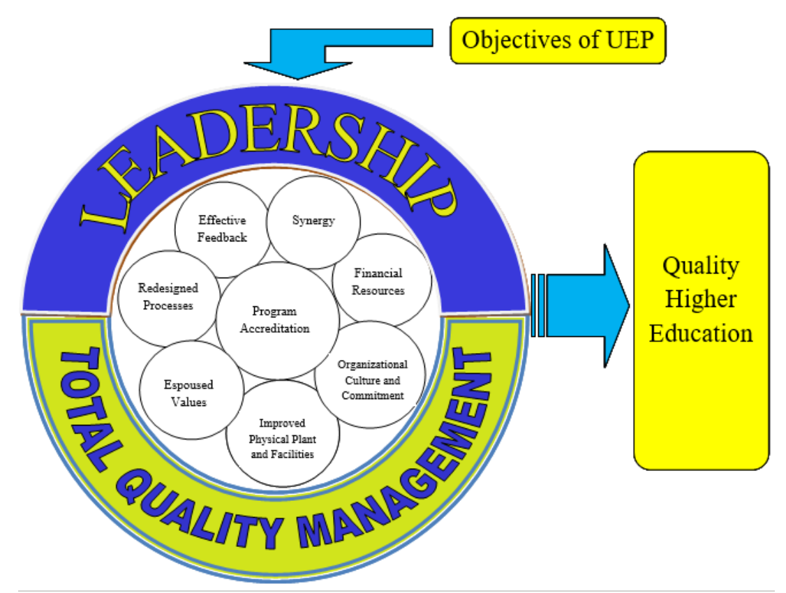
Figure 2: Model for Quality Education in the University of Eastern Philippines