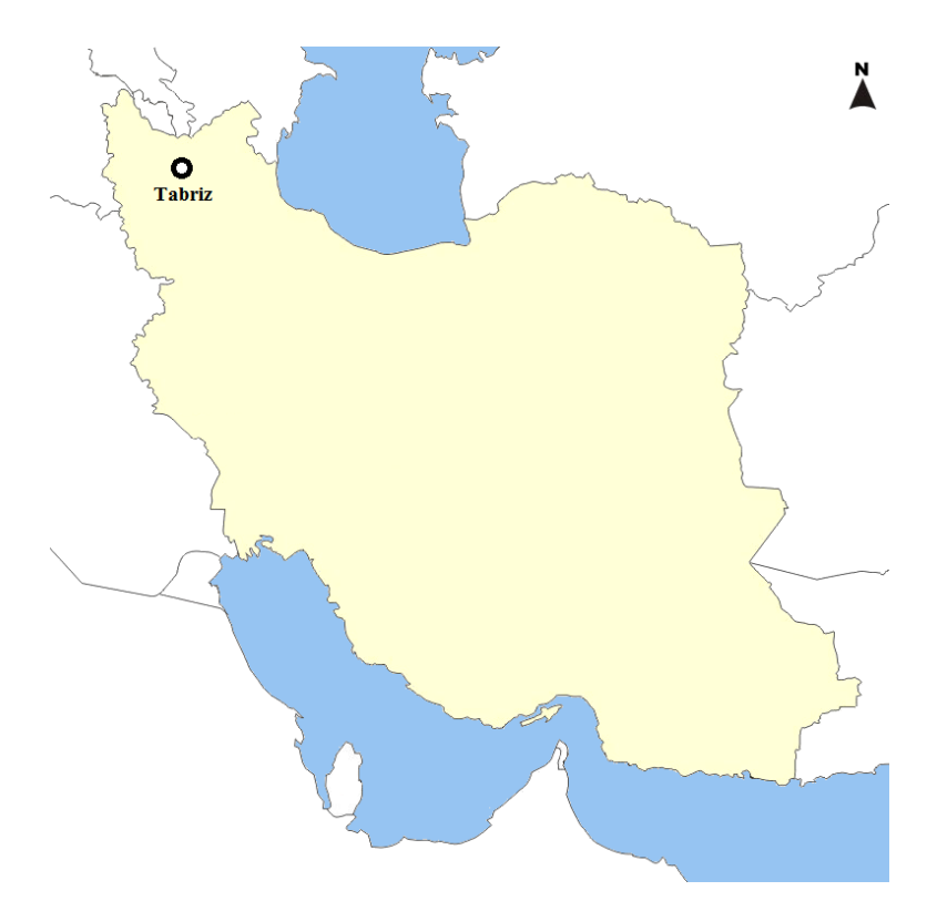
Figure 1: Geographical location of Tabriz city in schematic map of Iran