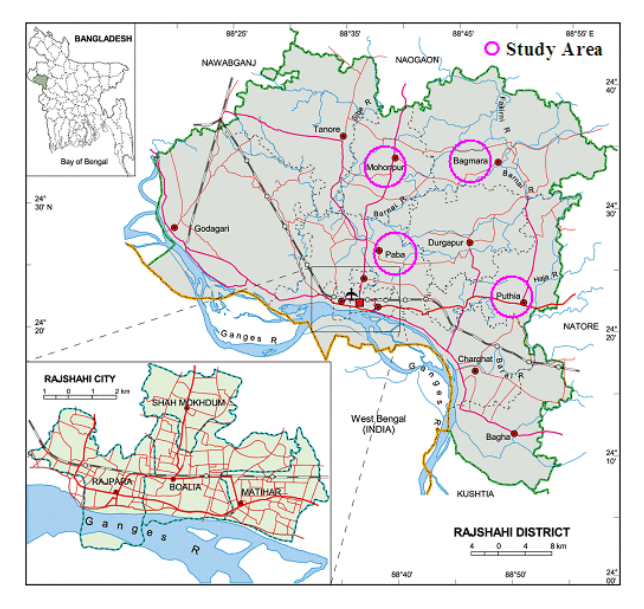
Figure 1: Map of Rajshahi district showing the study areas.

Study area and duration: This study deals with 13 hatcheries (Table 1) of Rajshahi district, Bangladesh. The study was carried out over a period of 10 months from March to December 2013. Rajshahi district is situated in the southwestern part of Rajshahi division and lies between 24°6′N and 25°13′N latitudes and between 49°02′ and 49°21′E longitudes (Figure 1).