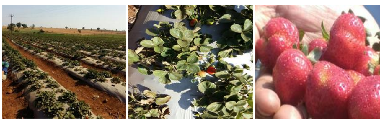
Strawberry Field at Motha (Melghat)