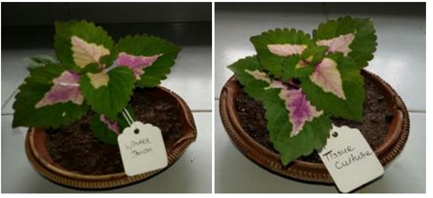
Soil Trap Culture