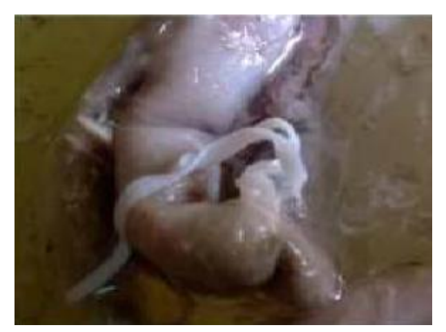
Attached cestode parasite

Histology of intestine of Channa gachua infected by Senga sonunae n.sp include both morphological and histopathological changes and exhibited excessive mucus secretion, the worms were found located in the lumen of intestine.