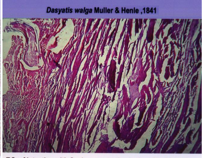
T.S. of intestine with Scolex penetreting in the villi of intestine