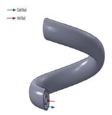
Fig. 1.1 Concept of Tube

A heat exchanger utilizes the fact that, where ever there is a temperature difference, flow of energy occurs. So, That Heat will Flow from higher Temperature heat reservoir to the Lower Temperature heat Reservoir. The flowing fluids provide the necessary temperature difference and thus force the energy to flow between them. The energy flowing in a heat exchanger may be either sensible energy or latent heat of flowing fluids. The fluid which gives its energy is known as hot fluid. The fluid which receives energy is known as cold fluid. It is but obvious that, Temperature of hot fluid will decrease while the temperature of cold fluid will increase in heat exchanger.