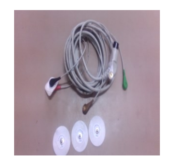
Fig1:Multiparamonitor Fig 2: Multiparameter electrodes