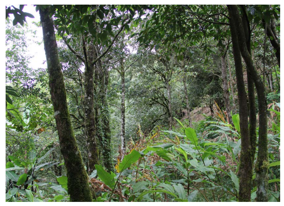
Figure 3 Habitat of Japalura chapaensis in Lvchun, southeastern Yunnan Province, China

For the remaining mainland congeners from non-Himalayan regions, J. chapaensis differs from J. fasciata by having a longer tail (TAL >204% SVL vs. <180%) and longer hind limbs (HLL >74% SVL vs. <69%), and by the absence of a transverse hourglass-shaped marking on the dorsum (vs. present); from J. batangensis, J. brevicauda, J. dymondi, J. flaviceps, J. grahami, J. iadina, J. laeviventris, J. splendida, J. vela, J. yulongensis, and J. zhaoermii by having significantly enlarged nuchal crest scales (vs. not significantly differentiated from dorsal crest scales), bright yellow oral cavity (vs. flash color or blackish blue), and by the absence of a transverse gular fold (vs. present); from J. varcoae by having a concealed tympanum (vs. exposed) and enlarged, differentiated nuchal crest scales (vs. not significantly differentiated); and from J. micangshanensis by having significantly enlarged nuchal crest scales (vs. not significantly differentiated from dorsal crest scales) and by the presence of gular spots (vs. absent).