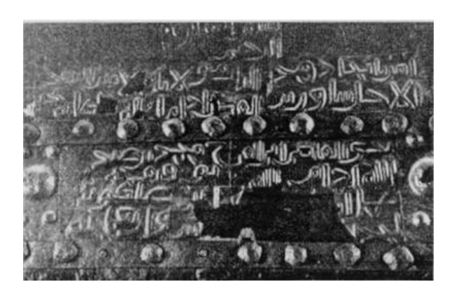
Picture 1 - The inscription on the surface of one half of the Ganja Gate, which is kept in the Monastery of Gelaty near Kutaisi, the Republic of Georgia