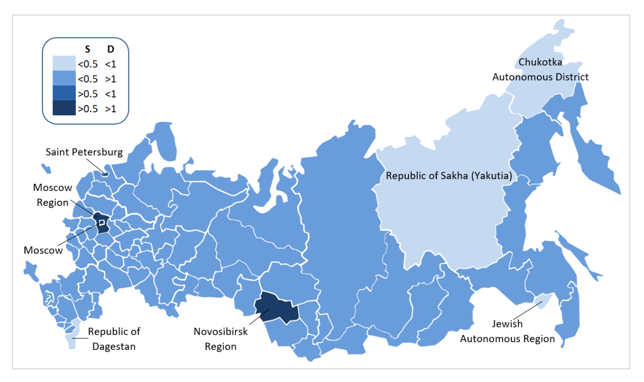
Fig.2. Regional differences in Russian trade, 2016 (Federal State Statistics Service, n. d.; authors' calculations)

ISSN 2345-0282 (online) <a href="http://jssidoi.org/jesi/2018">http://jssidoi.org/jesi/2018</a> Volume 6 Number 2 (December) <a href="http://doi.org/10.9770/jesi.2018.6.2(30)">http://doi.org/10.9770/jesi.2018.6.2(30)</a>