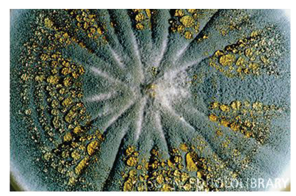
Fig. 2. Laboratory Petri-dish culture of the fungus Penicillium chrysogenum growing on agar with the produced antibiotic penicillin. [5]

cillin, and penicillin V. Penicillin antibiotics are historically significant because they are the first drugs that were effective against many previously serious diseases such as syphilis and infections caused by staphylococci and streptococci. Penicillins are still widely used today, though many types of bacteria are now resistant. All penicillins are beta-lactam antibiotics and are used in the treatment of bacterial infections caused by susceptible, usually Gram-positive, organisms [60].