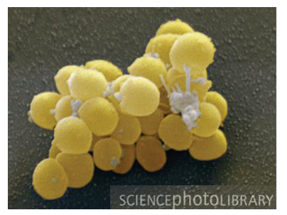
Fig. 5. Coloured scanning electron micrograph (SEM) of Staphylococcus aureus bacteria at magnification ×16000. [5]