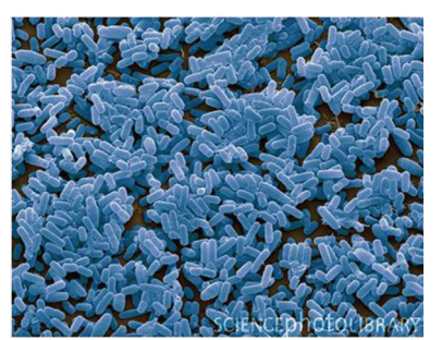
Fig. 4. Coloured scanning electron micrograph (SEM) of Bacillus subtilis bacteria at magnification ×12000. [5]

In 2007, three papers have been published reporting the use of blue aggregated mixtures of drugs and NPs, rather than of stable red conjugates [71-73]. Such a color change and transmission electron microscopy (TEM) images unambiguously indicated NP aggregation. The drugs used were aminoglycoside antibiotics (streptomycin, gentamicin, kanamycin, and neomycin), quinolones (ciprofloxacin, gatifloxacin, and norfloxacin), ampicillin (a penicillin antibiotic), and 5-fluorouracil (an antimetabolite of nucleic metabolism). The preparations were tested for antibacterial activity toward gram-positive (Bacillus subtilis, Staphylococcus aureus, Micrococcus luteus) and gram-negative (E. coli, Pseudomonas aeruginosa) microorganisms and they also were examined for antifungal activity toward Aspergillus fumigatus and Aspergillus niger (Fig. 4, 5). The basic experimental tests for the determination of antibacterial activity were the disk diffusion method and the agar diffusion method. Depending on the antibiotic used, increase in the activity of the antibiotic-colloidal-silver mixture ranged from 12 to 40%, as compared with the activities of the native drugs. So, the antibacterial activities of the antibiotics were enhanced through the use of silver NPs.