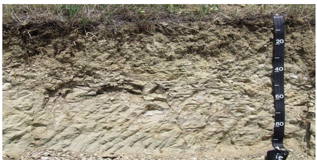
Foto 2. Profile 1, over Pliocene sediments, village of Vinogradi, South Bulgaria

The main diagnostic soil characteristics were obtained using the following methods: Soil pH was measured in water suspension 1:2.5. The exchangeable Al^{3+} was determined titrimetrically after displacement of Al^{3+} ions by 1N CaCl2. The total exchangeable hydrogen exch. H_{8,2}^{+} (total acidity) and exchangeable bases (Ca<sup>2+</sup> and Mg<sup>2+</sup>) were determined, titrimetrically and complexometrically, respectively, after saturation of the soil sample with buffer solution (Na-acetate and K-maleate, pH_{(H2O)} 8.2). The cation exchange capacity (CEC) was calculated by the sum of H_{8,2}^{+} and exchangeable bases in mequ/100g method of Ganev et al. (1980). Base saturation is the percentage of CEC that is saturated with base exchangeable cations (Ca2+ and Mg2+), V%= \Sigma sum of base exchangeable cations/CEC*100. For statistical analyses and graphics was used Microsoft Excel 2010 software.