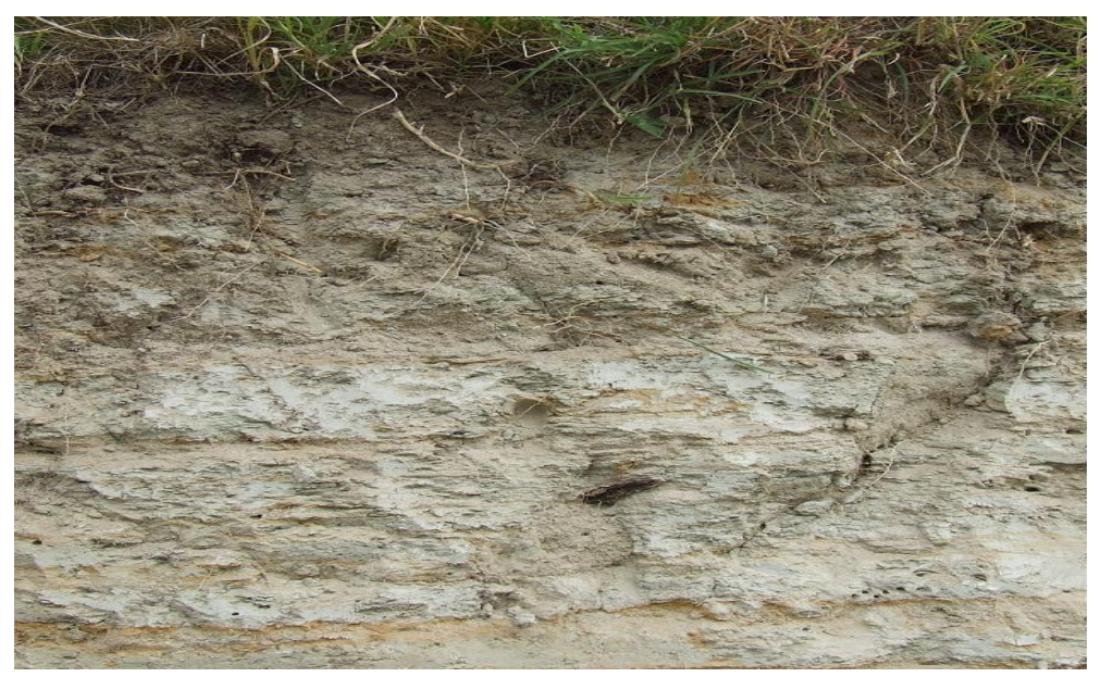
Foto 3. Profile 18, over quaternary loess, village of Opanetz North Bulgaria

The main diagnostic soil characteristics were obtained using the following methods: Soil pH was measured in water suspension 1:2.5. The exchangeable Al^{3+} was determined titrimetrically after displacement of Al^{3+} ions by 1N CaCl2. The total exchangeable hydrogen exch. H_{8,2}^{+} (total acidity) and exchangeable bases (Ca<sup>2+</sup> and Mg<sup>2+</sup>) were determined, titrimetrically and complexometrically, respectively, after saturation of the soil sample with buffer solution (Na-acetate and K-maleate, pH_{(H2O)} 8.2). The cation exchange capacity (CEC) was calculated by the sum of H_{8,2}^{+} and exchangeable bases in mequ/100g method of Ganev et al. (1980). Base saturation is the percentage of CEC that is saturated with base exchangeable cations (Ca2+ and Mg2+), V%= \Sigma sum of base exchangeable cations/CEC*100. For statistical analyses and graphics was used Microsoft Excel 2010 software.