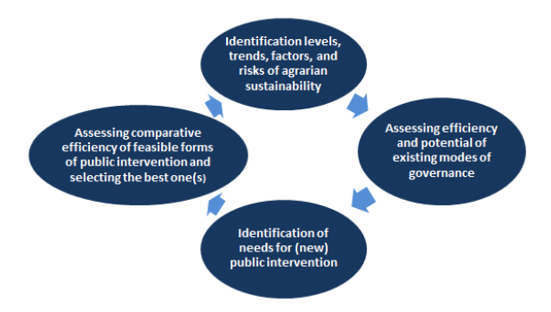
Figure 3. Stages for improvement of governance of agrarian sustainability

Efficiency of individual modes should be evaluated in terms of their absolute and comparative potential to safeguard and develop agents rights and investments, stimulate socially desirable level of rural welfare, economic growth and environmental protection activity, rapid detection of problems and risks, cooperation and reconciliation of conflicts, and save and recover total governing costs. Assessment should be also made on complementarities and/or contradictions between different governance forms – e.g. high complementarities between (some) private, market and public forms of governance; conflicts between "gray" and "light" sector of agriculture, etc.