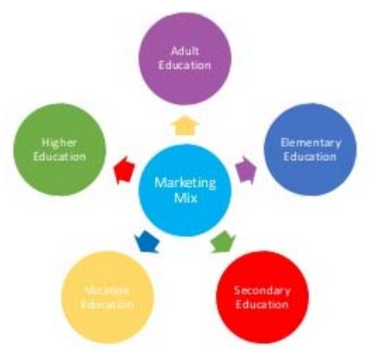
Figure no. 2. Educational marketing mix