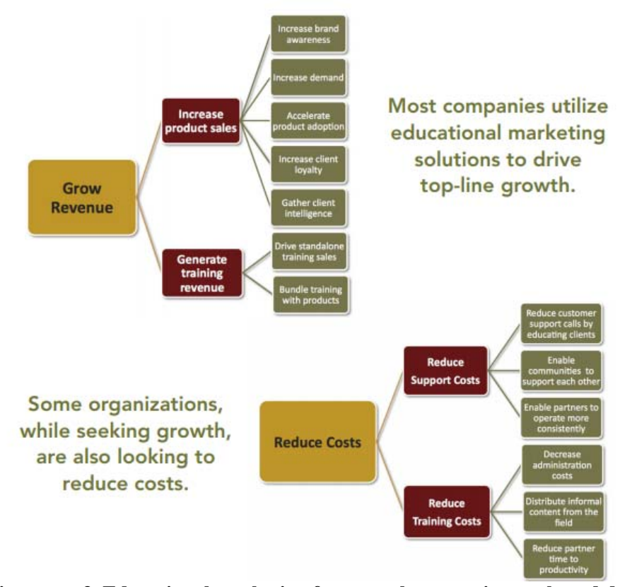
Figure no. 3. Educational marketing framework – mapping goals and drivers