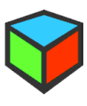
Figure 1. A representation of all four Figure 2. A representation one particular