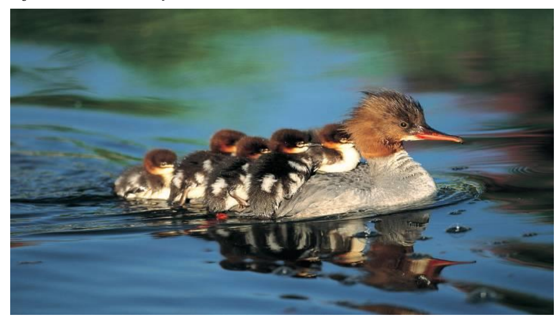
4.1. The Duck Family: Activity 1