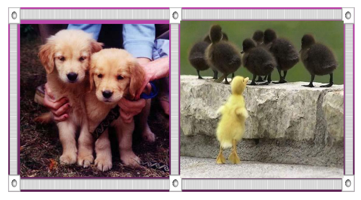
Figure 5. It's Hard to be a Puppy