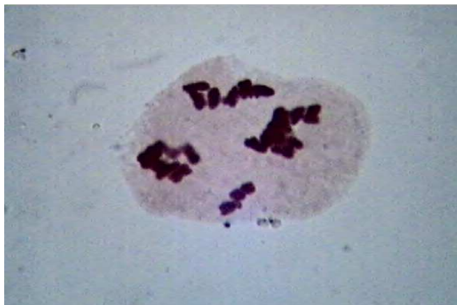
Figure 2: Mitotic Plate of the Treated Root Tip Showing Clump Clusters