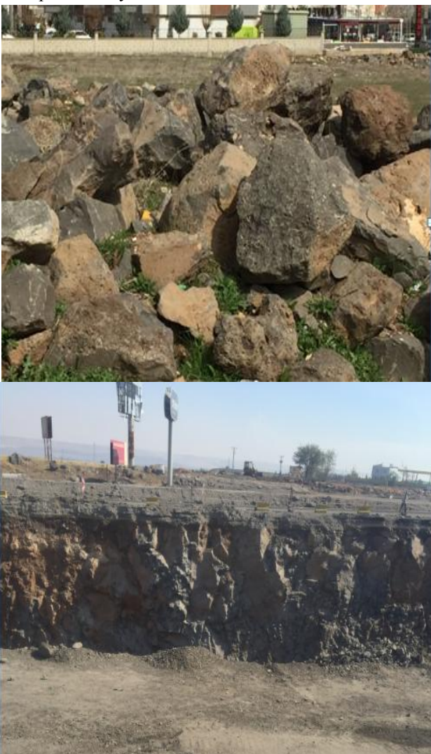
Figure 1: Distribution of basalt samples in Diyarbakır

Being locally as thick as 150 metres in Diyarbakır and its neighbourhood, Karacadağ basalt deposits cover an area of 10000 kilometre square in Southeast Anatolia, Turkey and occur half metre below the soilcover or as a surface cover. The creeping basalt flow from Karacadağ volcano that forms these basalt rocks is common notably in Diyarbakır. Wide basalt plateaus are found across 120 to 130 km in Diyarbakır-Şanlıurfa to the west, Diyarbakır-Elazıg to the north and Diyarbakır-Mardin highway to the east. Figure 1 illustrated as formation samples of basalt rock in central parts of Diyarbakır.