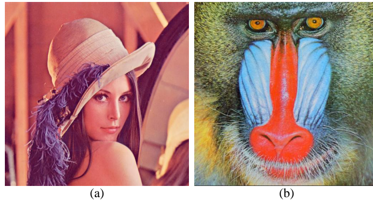
Figure 1: Two test images of the (a) Lena, (b) Baboon