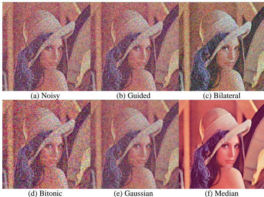
Figure 2: Simulation results of Impulse noise reduction in Lena image

Table 1 compared the results of PSNR and SSIM for the existing filtering techniques on Lena and Baboon images. For the Lena image, the Median filter technique shows better PSNR from 18.09 dB (Guided filter) to 9.73 dB (Gaussian filter) than other existing filtering techniques. Also, it can be seen that SSIM has an excellent performance. As can be seen in Table 1, the Median filter method shows better performance in PSNR and SSIM than the other filtering methods in baboon image (PSNR=19.44, SSIM=0.59).