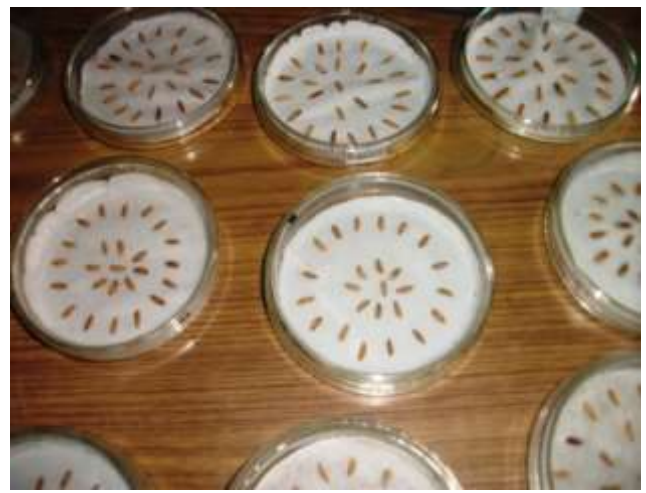
Fig 1: Arrangement of seeds on petri plates in 1:8:16 fashion.

Seed samples of each genotype were assayed for the presence of fungi by standard blotter method following the protocol of International Seed Testing Association (ISTA, 2003). Three layers of blotting paper (Whatman No. 1) moistened with sterile water were placed at the bottom of 9cm diameter petri-plates. Four hundred seeds of each genotype were surface disinfected in 1% freshly prepared sodium hypochlorite solution for 2 min. followed by rinsing twice with sterilized distilled water, air dried and then 25 sterilized seeds were plated onto moistened blotting paper in 1:8:16 fashion from the centre to periphery (Fig. 1). The plates were arranged in a completely randomized design with four replications (four plates/replication) and incubated in an incubator at 25±1°C under 12/12 alternating cycles of near ultra-violet light and darkness. Watering was done regularly to keep the filter paper moist.