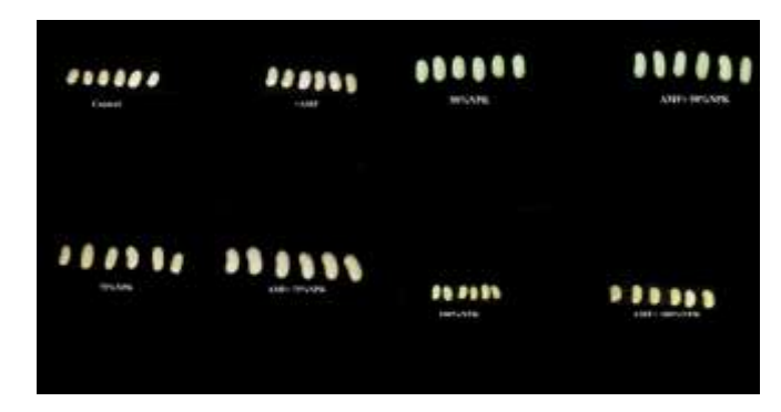
Fig.1 : Effect of different levels of NPK fertilizers on seeds yield of non-mycorrhizal and mycorrhizal common bean plants.

colonization was observed in the non-inoculated. AM colonization can improve the uptake of nutrients that can reflected on the yield components of common bean plants. This result supports the previous findings of (Smith and Gianinazzi-Pearson, 1990; Cavagnaro et al., 2005; Sheng et al., 2013) who indicated that increased soil phosphorus generally reduced AMF development and consequently the mycorrhizal benefits. In addition, these results are in accordance also with Abdullahi and Sheriff (2013) who reported that Root% colonization was affected with increase in fertilizer application in all the treatments. Thus, the high rate of chemical fertilizers application, led to antagonistic interaction with mycorrhiza. Mycorrhizal colonization % level of inoculated plant with increase in fertilizer application is in agreement with the fact that excessive chemical fertilizers have negative effect on AMF colonization (Valentine et al., 2001; Gryndler et al., 2005).