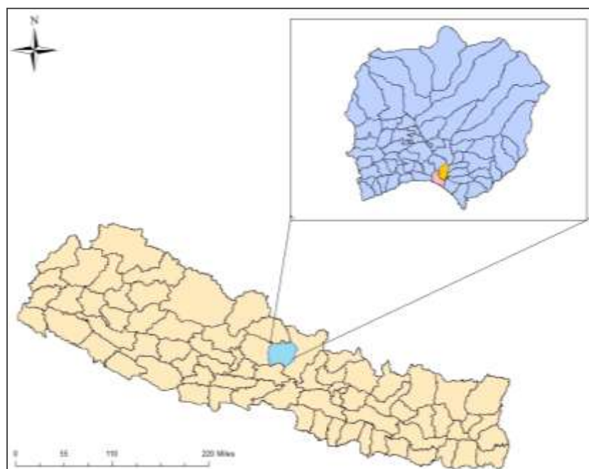
Fig. 1: Experimental site at Lamjung district, Nepal.

Hybrid rice US382 and Improved rice; Ramdhan was transplanted from 17 th July 2015 in farmer field according to the treatment set-up. Harvesting was done from 17 th – 19 th November, 2015. Observation on plant ht, effective and non-effective tiller per hill, Leaf Area Index, panicle weight, panicle length, filled and unfilled grain, biological yield, straw yield, yield at 15% ( \text{tonha}^{-1} ) was taken. Gross plot size of 100 \text{m}^2 for each treatment was maintained in each farmer's field. The actual rice yield was taken from net area of 10 \text{m}^2 .