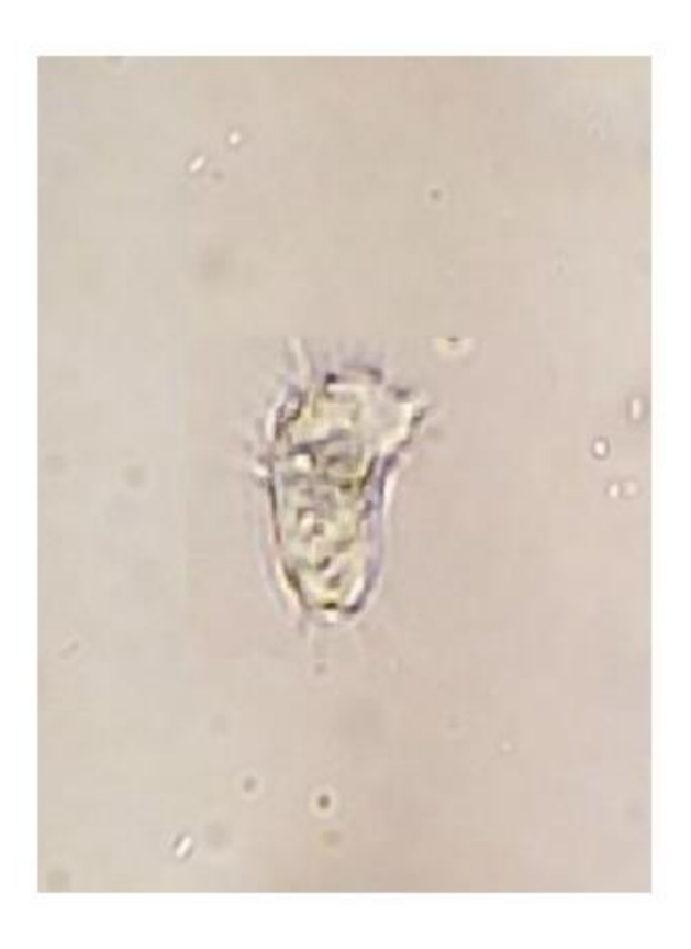
Fig. 2: Acanthamoeba trophozoites in saline (40X).