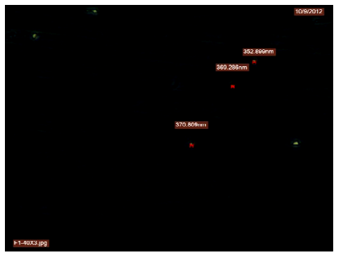
Wrightia arborea Phytosome WAP (40 x)