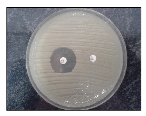
Fig. 1. Confirmatory combination disk method, the appearance of ESBL producing isolate.