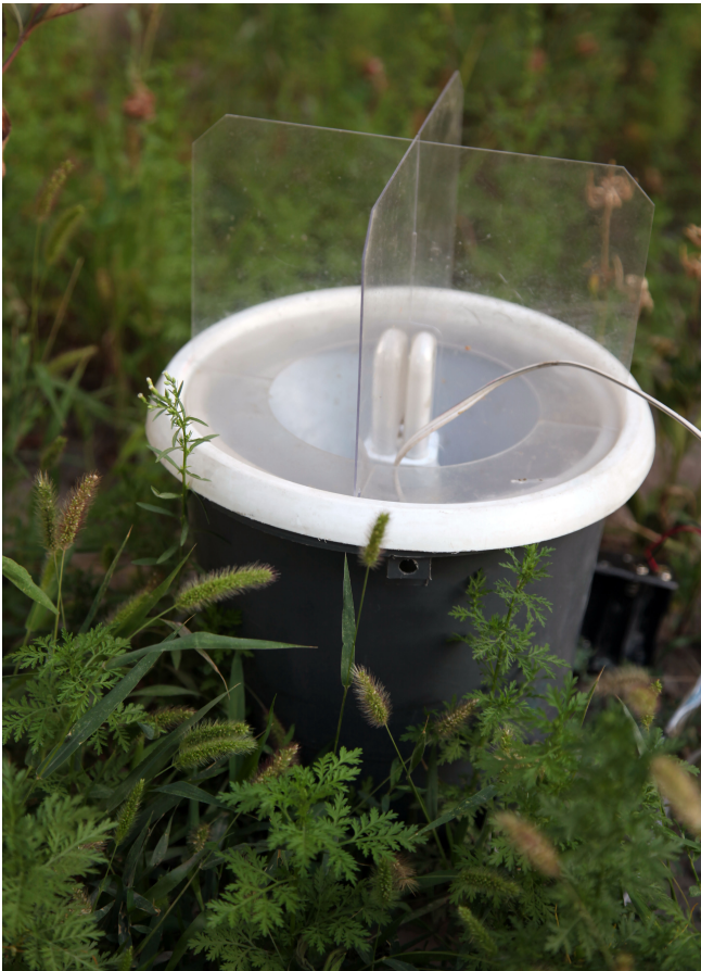
Fig. 1. The light trap.

Its construction is based on a plastic bucket into which a fast-working poison is placed (I use tetrachloroethane) as well as some layers of the cell-carton (I use the eggs carton pieces). The bucket is equipped with the attractor (UV-lamp) and a trapping device. The last one contains a wide-mouthed funnel and three plastic shields (one is rounded and two are rectangular). An electric circuit that consists of the power supply (I am using the battery block of eight AA-batteries with voltage of 1.5V each, in total 12V), the inverter (it transforms 12V to 220V) and the automatic electric switch (I use the photocell) powers the lamp.