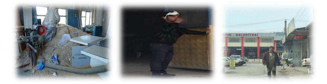
Figure 4. Psychosocial Risk Factors.

As biological risk factors, fungus, insects etc. arising as a result of materials stored in damp and dark places could threaten workers' health. Unattended dogs, cats as well as pigeons, birds nesting inside the business could carry biological microorganisms such as parasites and microbes which could threaten human health. These businesses have risks of fungi, bacteria etc.