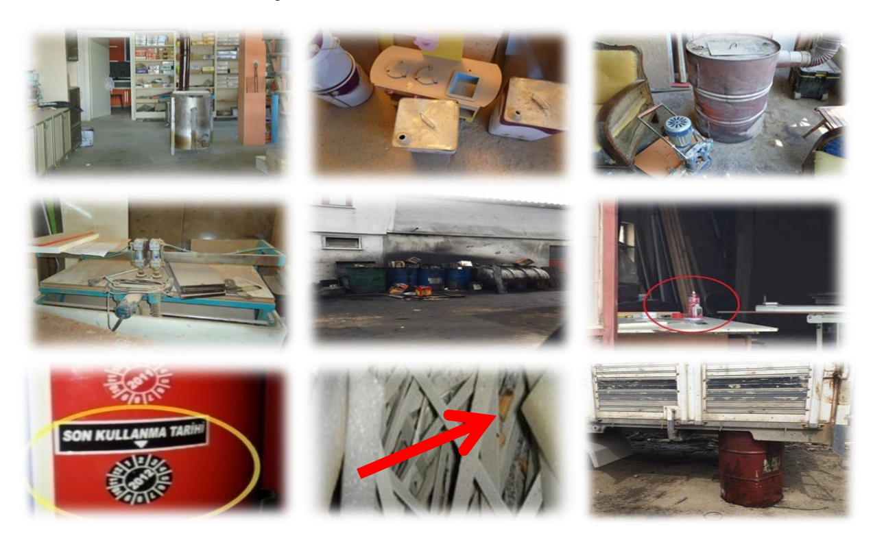
Figure 2. Chemical Risk Factors

machine tool cupboards etc. are not well mounted well on the walls. Air-conditioning systems are not designed according to working conditions. The working environment is unorganized. The heating systems in the businesses are not convenient for the working environment.