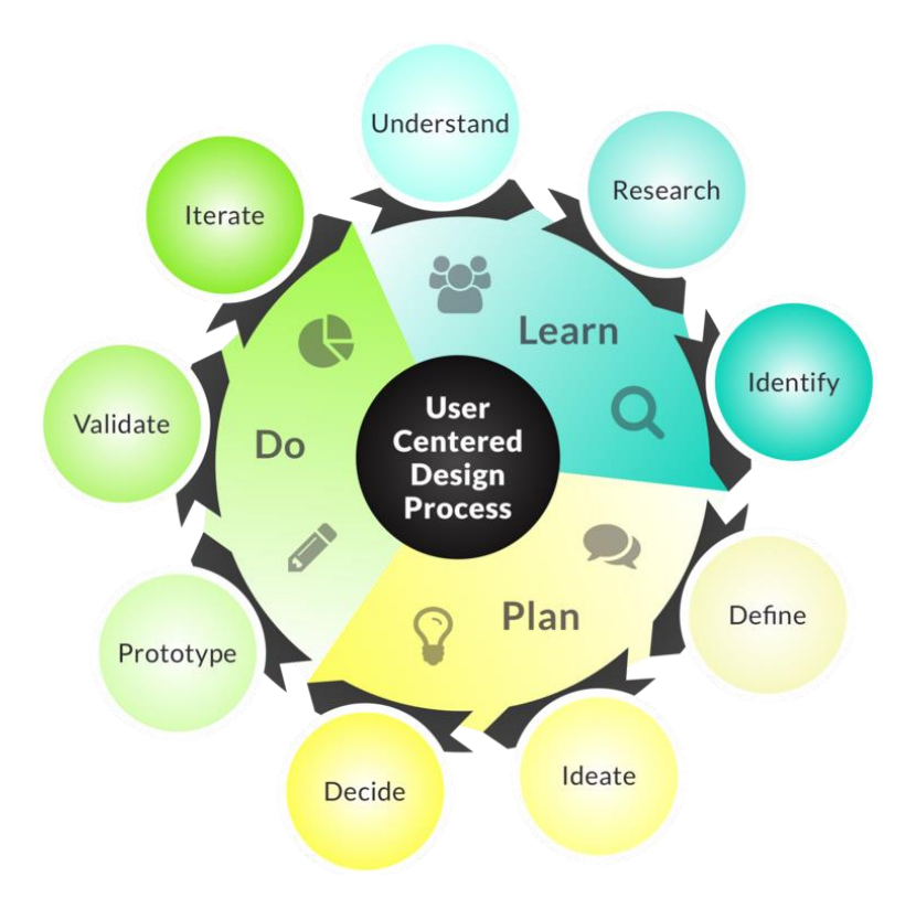
Figure 6. User-centered design process (URL-15, 2017).

The expression UCD was first coined in the research laboratory of Donald Norman in San Diego University in California in 1980s. The term later started to be used widely after the publication of co-authored "User-Centered System Design: New Perspectives on Human-Computer Interaction" book (Norman and Draper, 1986; Cao, 2014). In his "The Psychology of Everyday Things (POET)" book, Norman (1988) discusses the concept of UCD (Salvendy, 2012; Stephanidis C et al., 2012; van den Hoven et al., 2015). The design process of UCD is shown in Figure 6.