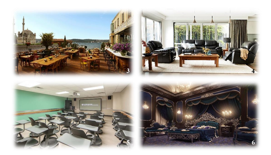
Figure 1. Examples of today's interior and exterior furniture (URL-3, URL-4, URL-5 and URL-6, 2017).

There has been a tremendous increase in furniture demand lately. The main reason behind preferred wood material in furniture is because working, assembling, changing when it wears and doing the top surface treatment can be done easily and it has a high resistance (Erdem, 2007). It is seen that product diversity in the furniture industry, which has an outstanding place among traditional sectors in terms of employment and production, is quite a lot. The Furniture industry is partitioned into distinct product categories such as office furniture, kitchen furniture, bedroom furniture and dining room furniture, all of which has separate market divisions (Yılmaz, 2014).