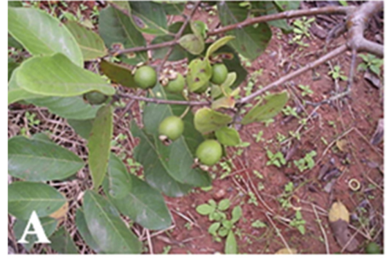
Figure 1. A-B. Vines of Psidium araca Raddi: A. Individuals established in Vitoria de Santo Antão, Pernambuco; B. Individuals established in Curado, Pernambuco.

The fruits of araçá (Figure 1) were harvested during the period from August to September of 2014 at three different locations in the state of Pernambuco: a) in the fruit plantation near the Terminal Integrado de Passageiro (TIP) in Recife, Curado district; b) in the municipality of Vitória de Santo Antão; and c) on the beach of Catuama, in the municipality of Goiana, 72 km from Recife (capital of Pernambuco State).