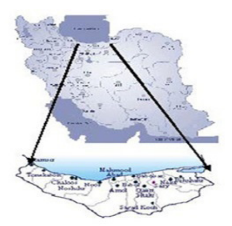
Figure 1. The Mazandran province map based on the townships and their location.

Ascariasis and trichuriasis are two important intestinal geohelminthic diseases with clinical and public health significance (1,5,7). In recent years, medical sciences researchers, in order to extend knowledge on distribution of infectious diseases for planning and implementing effective treatment measures, have used geographic information system (GIS) and the occurrence of disease in a particular past period to monitor the disease and health conditions. Some researchers, using GIS and plotting distribution of a disease on a map have investigated Fascioliasis in northern Iran and presented a map of the Visceral leishmaniasis disease, indicating the high risk regions in