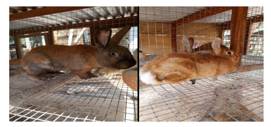
Fig. 5 . Exotic rabbits in their hutches at Savanna Farms, Ashanti Region, Ghana

As the Government of Ghana launched the "Planting for Food and Job Campaign" in 2017, a similar policy should target sustainable meat production in Ghana (Frimpong, 2017). This is worth considering as a nation because of the inadequacy of meat production and related health problems (Health Grove, n.d). In that sense, rabbit breeding and consumption can be given the priority and support as done during the NRP days.