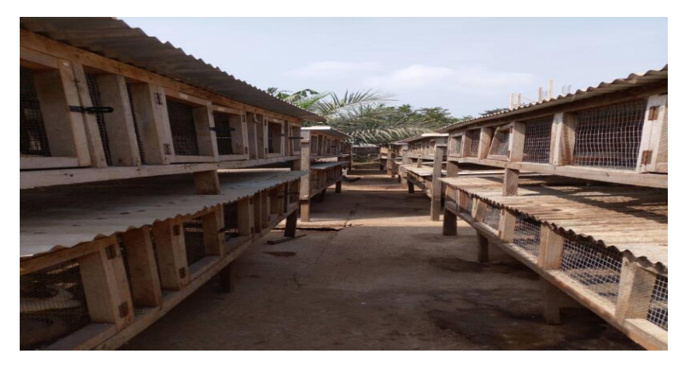
Fig. 2 . Rabbit hutches at Savanna Farms, Ashanti Region, Ghana

Post-independent Ghana had Ghanaians engaging in small backyard rabbit breeding. Though this farming was ongoing, it is vital to note that the movement of keeping domestic rabbits on a more extensive and popular scale began in Ghana during the NRC's OYF (Lukefahr, 2000).