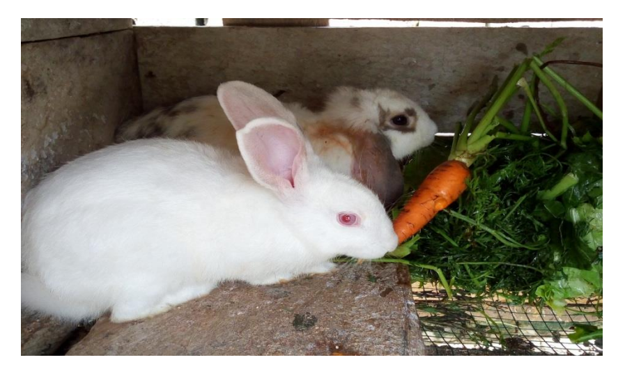
Fig. 1. Rabbits feeding on vegetable leftovers at Rabbit Reino, Eastern Region, Ghana

Currently, rabbit breeding is done at the backyards of local Ghanaian farmers, with few commercial breeders. To begin and maintain a rabbit farm, basic guide is provided by Ghana's Ministry of Food and Agriculture (n.d.) at their district and regional offices. Generally, the ministry recommends that a healthy breeding stock should be obtained from a trusted rabbit breeder to start with. Other necessary information like reproduction, hutch construction, feed rack and nest box construction, site for breeding, and issues regarding feeding are briefly outlined on their website<sup>*</sup> (see examples from local farms in Figure 1, 2).