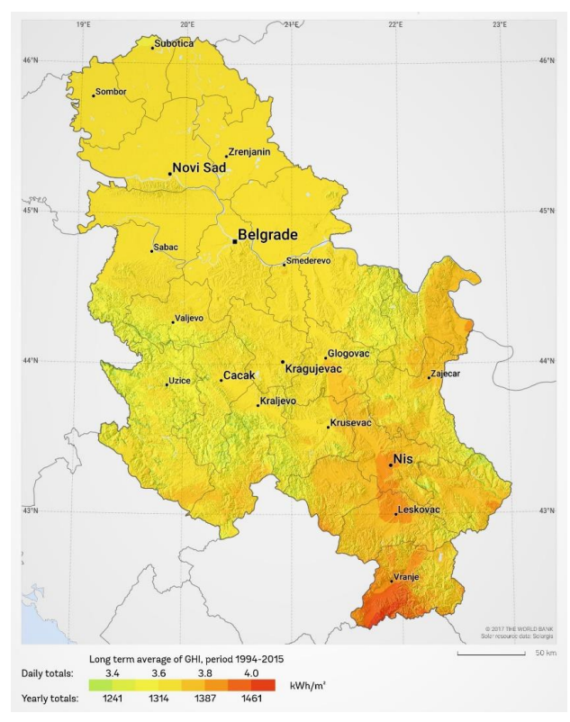
Fig. 2. Global horizontal irradiation - Republic Serbia

Heat solar systems are often used for heating of sanitary water, heating of technical water, heating of water in pools, etc. [44]. Solar energy can cover 50–70% even more of annual energy demand for water heating in households, during summer and transitional periods can be substitute almost