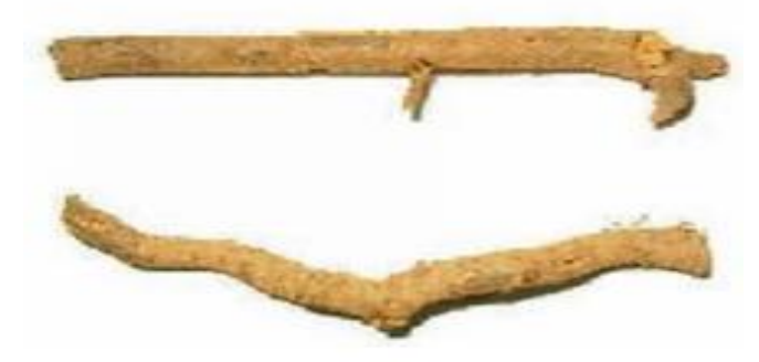
Fig. 1: Morphology of Plumbago zeylanica L. root.

profile of a crude drug for its appropriate evaluation. For preliminary phytochemical screening extracts were subjected using the standard procedure for identifying various phytoconstituents. <sup>[24-25]</sup>