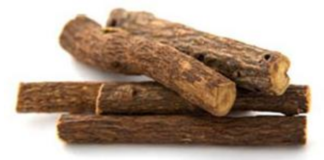
Fig. 2: Glycyrrhiza glabra root