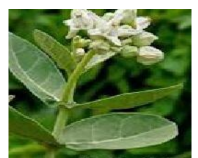
Fig. 1: Calotropis gigantea

Therefore the present study is focused on the investigation of the potent medicinal herbs such as Calotropis gigantea and Glycyrrhiza glabra for their anti-inflammatory activity.