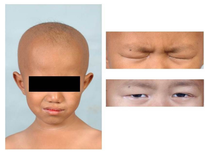
Fig 1. Diffuse non-scarring alopecia with sparse hair and photophobia.

even though the polymerase chain reaction and viral isolation from corneal scraping were all negative. Regular lubricant eye drops were also prescribed. Diffuse corneal neovascularization was still seen, but the symptom of photophobia was improved. He could open his eyes widely in normal light Fig 1.