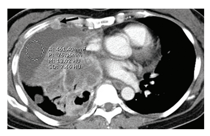
Fig 2. The post-contrast image of a 48-year-old woman with primary lung cancer and pleura metastasis, showed right pleural effusion, enhancing pleural nodule (arrow) and pleural thickening. The mean attenuation coefficient of right pleural effusion (circle) 461 mm<sup>2</sup> in size was 13 HU. The pleural effusion was classified as an exudate from thoracocentesis.