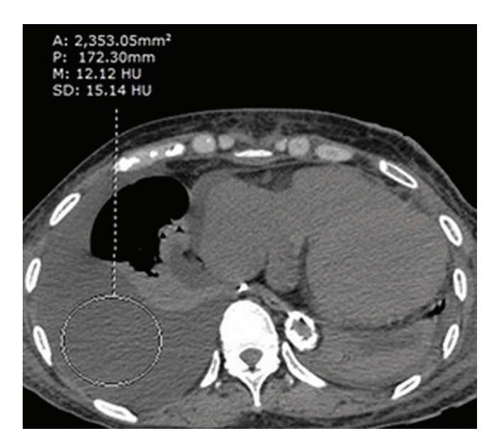
Fig 1. The precontrast image of a 43-year-old woman with acute renal failure and volume overload, shows bilateral pleural effusion. The mean attenuation coefficient of right pleural effusions (circle) 2,353 mm<sup>2</sup> in size was 12.12 HU. The pleural effusion was classified as a transudate from thoracocentesis.

of the maximal fluid accumulation on axial plane, and placed the ROI at each three contiguous slices in the same region. The mean attenuation values (Hounsfield Unit, HU) with standard deviation were measured. The average of the three levels was calculated. The image artifact, rib, lung parenchyma or pleura were avoided while placing the ROI (Fig 1). The CT attenuation value measurement was performed on pre-contrast and postcontrast CT images.