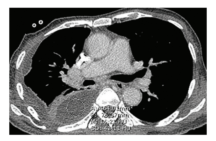
Fig 3. The post-contrast image of a 89-year-old man with empyema thoracis, showed right loculated pleural effusion. The mean attenuation coefficient of right pleural effusion (circle) 464 mm<sup>2</sup> in size was 16 HU. The pleural effusion was classified as an exudate from thoracocentesis.