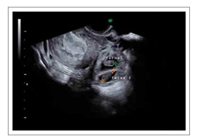
Fig 2. The left adnexal mass containing two gestational sacs with an alive embryo inside each sac.

A classic triad of symptoms associated with ectopic pregnancy is delayed menses, irregular bleeding and lower abdominal pain. Only 45% of cases present with these symptoms.<sup>13</sup> The most specific sign for diagnosing ectopic pregnancy from sonography is the demonstration of an adnexal gestational sac with a fetal pole and cardiac activity. In this case, the patient had such clinical features and transvaginal sonography demonstrated the alive twin embryos within the left adnexal mass.