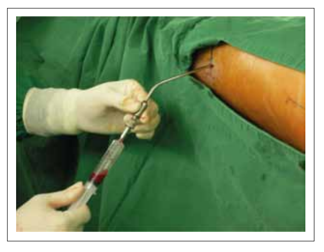
Fig 2. The medullary content can be aspirated prior to femoral canal rearning.

In our practice, this technique has been applied since 2008 in the cases of high risk for fat embolism, pathologic and impending pathologic fractures of the femur. All patients, comprising at least 10 patients, did not have significantly clinical symptoms and signs of pulmonary embolism. No fracture occurred at the location of the venting hole. However, intramedullary pressure could not be measured intraoperatively in our situation.