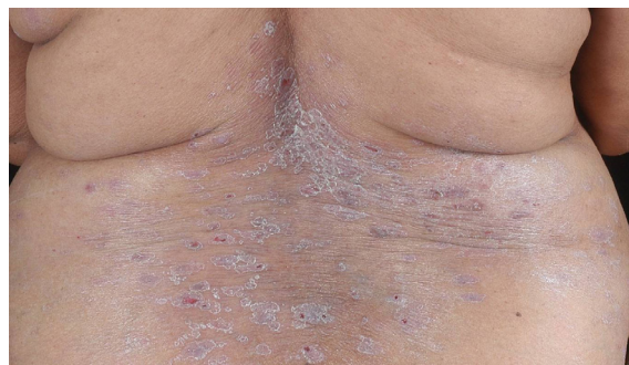
Fig 2. Physical examination revealed generalized well-defined scaly violaceous papules and plaques on the trunk.

Lichenoid reaction due to imatinib mesylate is rare. In 2010, Kuraishi N, et al., reviewed cutaneous side effect from Imatinib mesylate which had variable degrees of involvement. Most of them (78.6%) had only cutaneous lesions which might be mild to extensive. Mucosal involvement alone was rare (14.3%). 2 Moreover, from the literature reviews, there were only three cases presented with mucocutaneous eruption with palmoplantar involvement, the same clinical presentation as the presented patient. 1,2 The length of time before the adverse effects appeared after the initiation of the drug ranged from one to six months. 2 Nail dystrophy was also present. 1,2 The incidence and severities of adverse effects tend to depend on the dosage of imatinib mesylate. Most of the patients took imatinib mesylate 400 mg/day when they