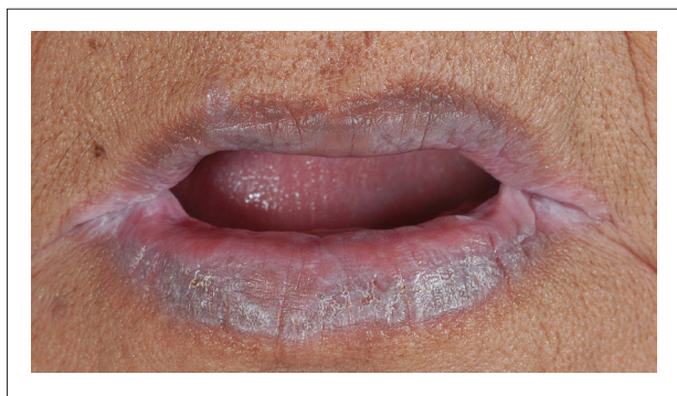
Fig 1. Physical examination revealed generalized well-defined scaly violaceous plaques on lower lip.

Most adverse reactions of imatinib mesylate including nausea, abdominal pain, diarrhea, myalgia and edema (commonly involving the periorbital areas and lower extremities) which are mild to moderate. 2 Approximately 31-44% of patients taking imatinib mesylate experience cutaneous reactions. 3 The most common cutaneous reaction is a maculopapular rash affecting the forearms and trunk. 2 Other cutaneous reactions include hair hypopigmentation, pruritus and pityriasis rosea-like eruption. 4,5 Severe cases with acute generalized exanthematous pustulosis, exfoliative dermatitis and Stevens-Johnson syndrome have also been reported. 6-8