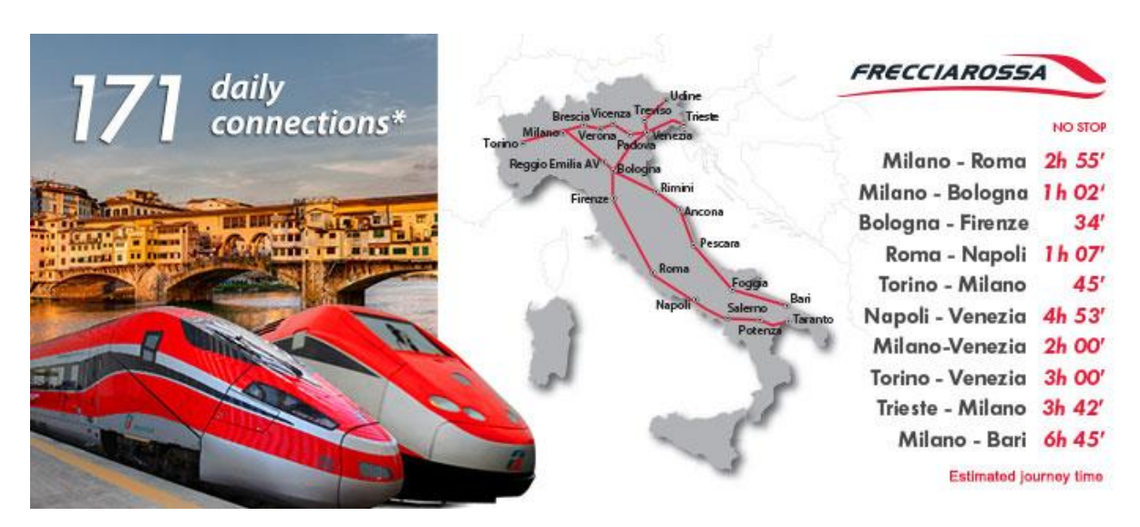
Fig. 2. High-speed railway lines serviced by Trenitalia and inter-station travel times [15]